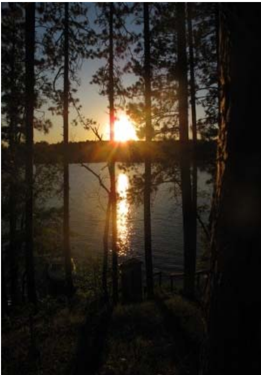
Another amazing sunset on Sibley Lake.